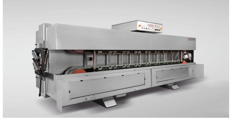
Belt-type Caterpillar AGP 270/33 for submarine cables

Belt-type Caterpillars AGP in horizontal/vertical design